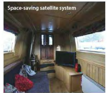
Space-saving satellite system